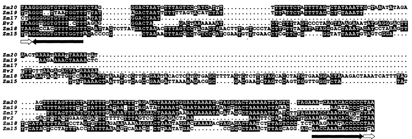
FIG. 1. Multiple alignments of members of the Tourist B (A), C (B), and D (C) subfamilies; only complete elements are shown. Alignments were performed using the GCG program PILEUP (with a gap penalty of 3.0 and a gap length penalty of 0.3) and visualized using BOXSHADE. The inverse orientations of Tourist-Sb2 , -Sb3 , -Sb6 , -Os1 , -Os2 , -Zm18 , and -Hv2 were used to obtain optimal alignment. Solid arrows indicate the approximate position of the TIRs and open arrows indicate the flanking direct repeats.

distinctive but related TIR sequence and their variable length (Fig. 1C).